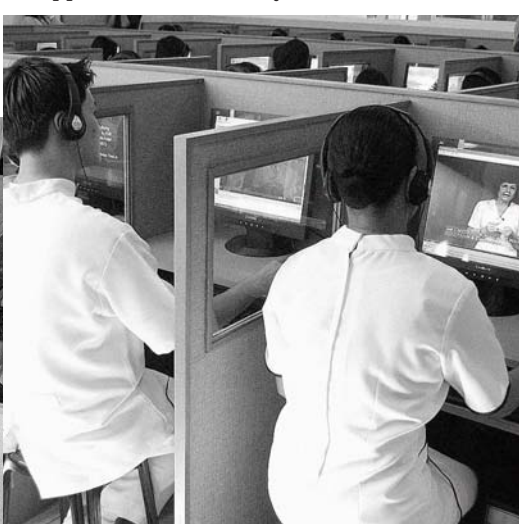
VIRTUAL HOSPITAL. Nursing students are exposed to hospital-related learning experiences even while inside the comfort of the newly furnished eLearning center at UC. Prior to their hospital duties, students enrolled in eNursing modules watch actual video footages, 3D animations and tutorials in preparation for actual clinical duties.

A Moral Compass . . . . . . to guide the lives of our students.